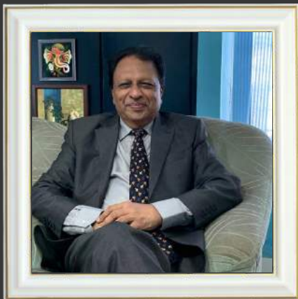
Amb TP Sreenivasan