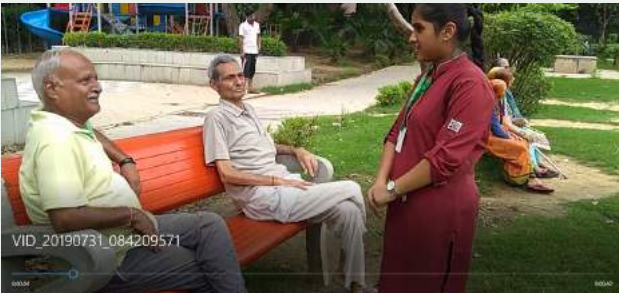
A student speaking to old people in the park on the importance of Swachh Bharat. July, 2019