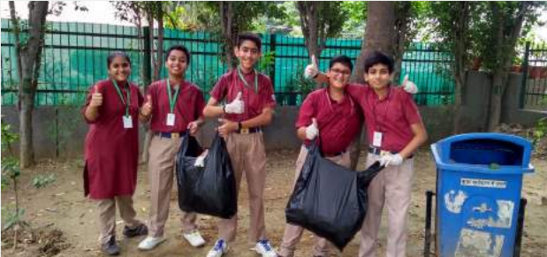
Plogging by the students of The Indian School, Sadiq Nagar. July, 2019

WOMENforINDIA conducts several awareness programs at prime locations in Delhi, to spread mass awareness on critical issues.