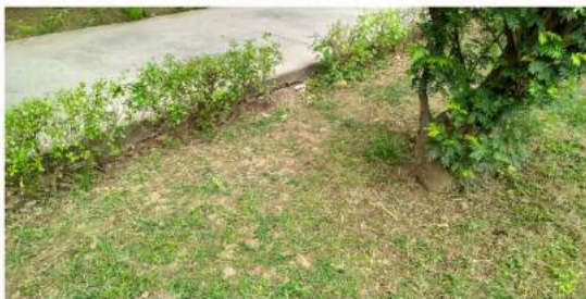
Before and after Swachhta Abhiyan July and Aug, 2019