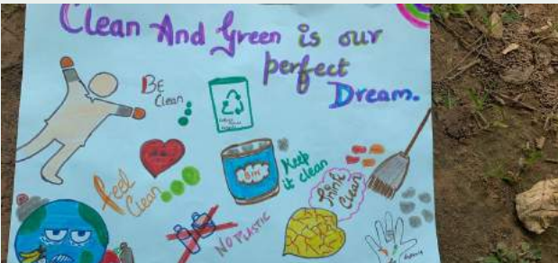
Best Poster on Swachh Bharat made by a government school student. August, 2019