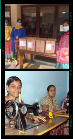
EMPLOYMENT GENERATION FOR WOMEN FROM THE HASTHAL AREA OF DELHI DURING THE PANDEMIC.