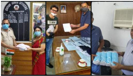
MASK/PPE KIT DISTRIBUTION TO THE CORONA WARRIORS/ AUTHORITIES IN THE STATES OF RAJASTHAN, HARYANA, PUNJAB, UTTARAKHAND AND DELHI