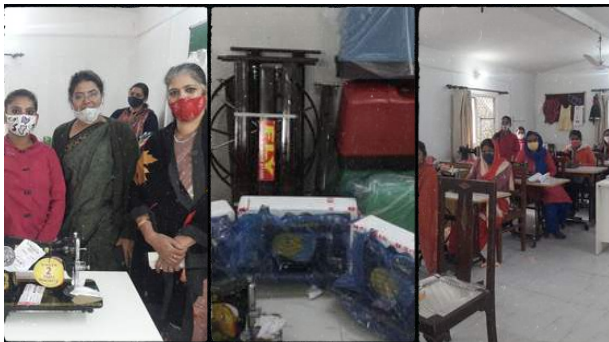
SKILLING MARGINALIZED GIRLS ON UPCYCLING. DISTRIBUTION OF SEWING MACHINES AT THE END OF THE TRAINING TO HELP THEM SUSTAIN THEMSELVES