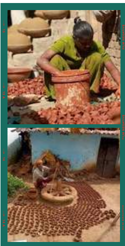
HELPING THE KUMHAR COMMUNITY DURING DIWALI TO SUSTAIN THEMSELVES BY PROVIDING FUNDS AND HELPING THEM SELL DIYAS